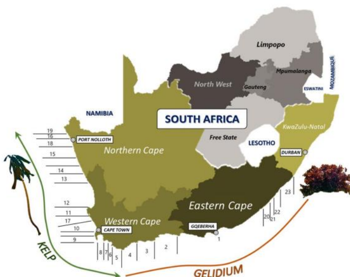
Map of seaweed concession areas in South Africa by Dr. Mark Rothman

Currently, the estimated total market worth of kelp in South Africa stands at ZAR 56.5 million. There are 23 Seaweed concession areas, with 13 having kelp rights (areas 5-9, 11-16 and 18-19). The harvesting of fresh kelp in South Africa started in the 1980s for biostimulant production and expanded in the 1990s to include kelp fronds and fresh beach-cast kelp harvesting for abalone feed. Initially, the focus was mainly to collect beach-cast kelp but now wild-harvested kelp is also being processed into fertilizers, animal feed, and biostimulants. Beach cast kelp is milled and sent for export to produce alginate.